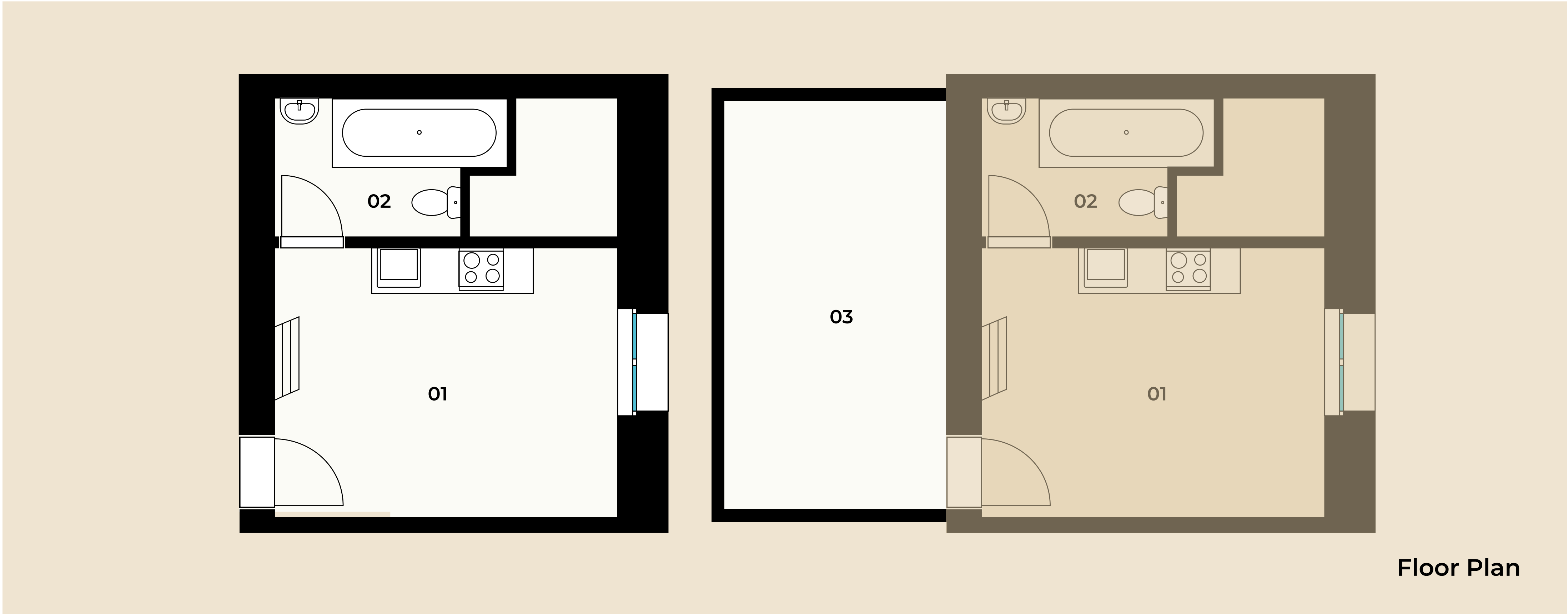
Location on the Floor